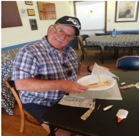
The other boats began to sport stars and glitter on sails and masts, simulated running lights and accessories and "interesting" paint designs on the hulls.